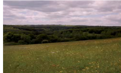
Herb rich horse grazed sward