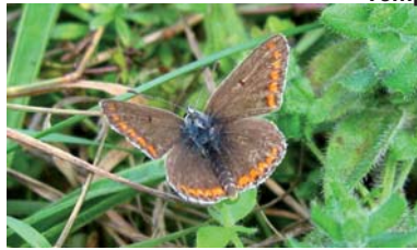
Brown argus larva requires food-plants such as common rock rose