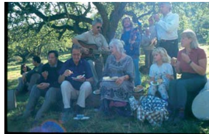
An event at No Man's Orchard