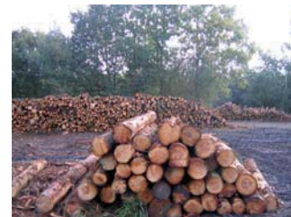
Crop thinning operations at Clowes

Visitors to Clowes Wood between Tyler Hill and Chestfield might have noticed the forestry work taking place over winter. The work is due to last over a year and has been contracted by the Forestry Commission who own the wood. It is all part of normal forestry operations and care is being taken not to damage the Crab and Winkle Way surface but some tracks in the wood will inevitably suffer some short term rutting. Clowes Wood has been identified by the Forestry Commission as a wood to return to native broadleaved trees so where conifer plantations are felled they will not be replanted with conifers. Meanwhile the RSPB have been busy improving paths at Blean Woods National Nature Reserve and producing a new leaflet for the Reserve tel: 01227 455972.