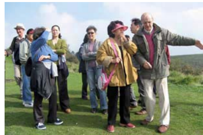
A guided walk for the Ashford International Chinese Association

Would you like to purchase some traditional bean and pea sticks for your garden or allotment? Not only will they look attractive but you'll be supporting a local product and avoiding, in some cases, bamboo imports. The KSCP carry out coppicing of hazel each year and we are offering to deliver bean and pea sticks while stocks last. The bean sticks will come in bundles of 10 costing £5. They are 8 feet (2 metres) long and most should last three years. Pea sticks - bundles of 20 at £3, are 3-4 feet (1 metre) and will probably only last one season. Contact the KSCP to place an order, delivery early April to locations within or close to the KSCP Project area.