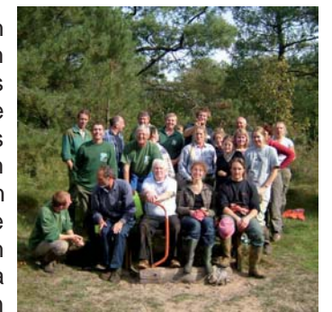
A joint KSCP Les Blongios task

Plans are underfoot for a French foray for KSCP volunteers with two planned exchange weekends in early 2008. February will see KSCP voyage across to Nord Pas de Calais to renew relations with French environmental conservation group "Les Blongios" before the return weekend 22 nd -23 rd March when the French will join us for a weekend of hedge planting in Hastingleigh near Wye.