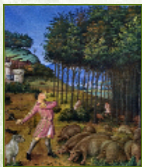
The tradition of 'Pannage' - the feeding of pigs on woodland nuts. ('Les tres riches heures - Novembre' Duc de Berry.)

The woodland provided their ecclesiastical owners with wood for construction and an income in the form of timber products, such as faggots (bundles of wood for heating and cooking), and pig pasture. Institutional ownership resulted in centuries of well organised management and conservation. Remnants of ditches and woodbanks remain that once marked boundaries and provided protection for young saplings from the grazing animals.