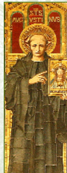
St Augustine, depicted in Westminster Abbey.