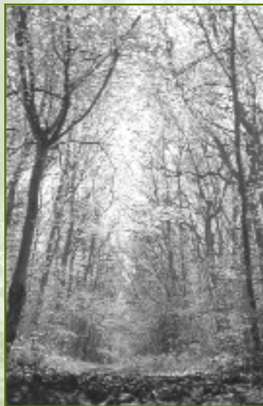
Towering columns of Blean trees. (Diane Comley.)

The church and its institutions became substantial landowners in the area. The Domesday Book of 1086 recorded that 9 of the 12 local manors were owned by either the Archbishop, St Augustine's Abbey or the Cathedral Priory. Each of these manors incorporated sizeable areas of Blean woods, which by the 11th Century is believed to have covered an area similar to that which it covers today - approximately 11 square miles.