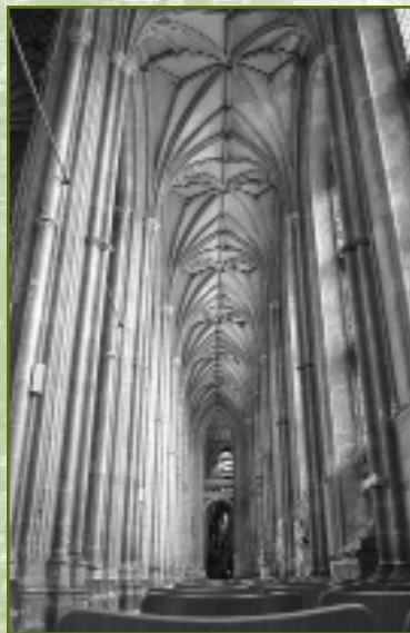
Canterbury Cathedral choir.

Canterbury has been synonymous with Christianity in England since the arrival in 597AD of Augustine, who was sent by the Pope to convert the Saxons, and became the first Archbishop of Canterbury. Today it continues to be the seat or 'cathedra' of the Archbishop, Head of the Church of England and worldwide Anglican Communion.