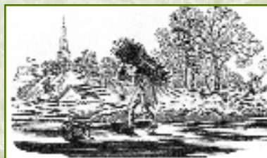
Man carrying a 'faggot'. (Thomas Bewick.)