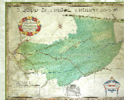
A 1718 map of Christ Church Wood, then owned by the Dean and Chapter of Christ Church, now known as Church Wood. The map appears upside down as it is drawn with south at the top!